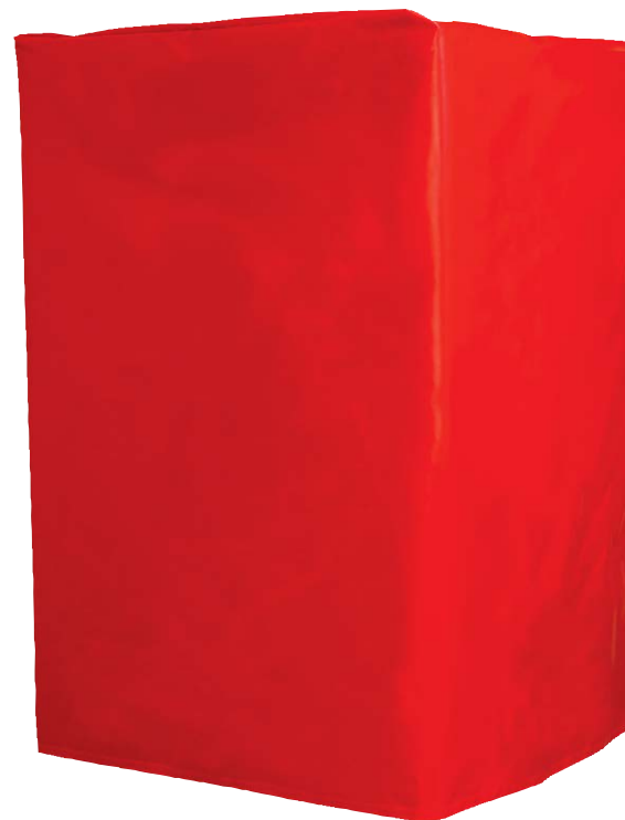
› EXTWU3/R : Wheeled Unit Cover - Size 3