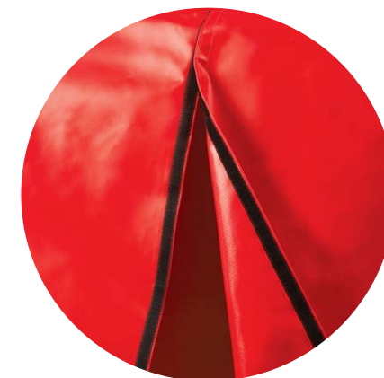
Velcro fastening for tailored fit