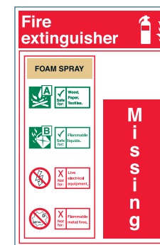
› 50134F : Foam