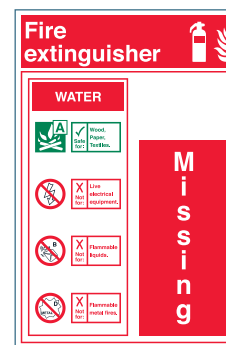
› 50132F : Water