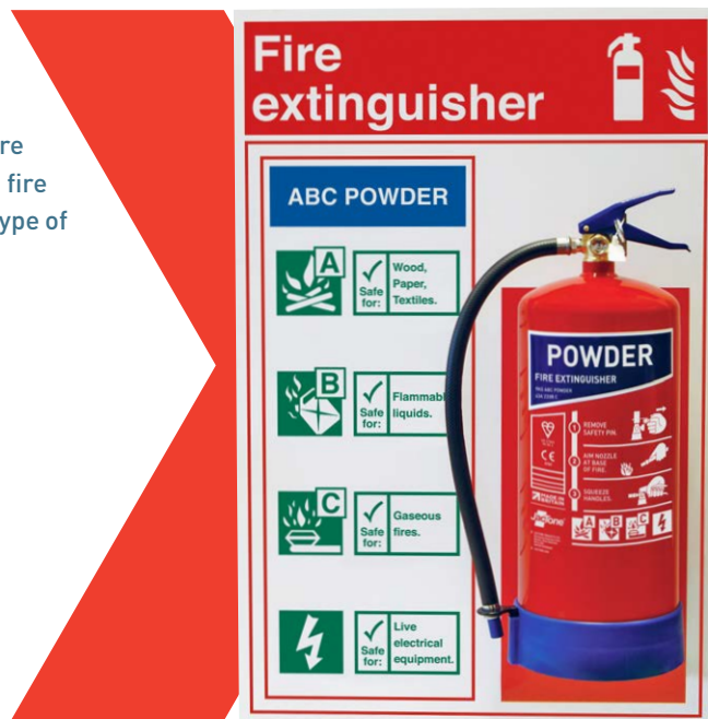
› 50135F : ABC Powder