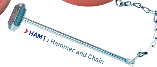
› HAM1 : Hammer and Chain