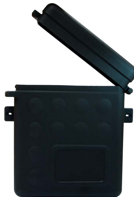
› X3287 : Black Document Holder