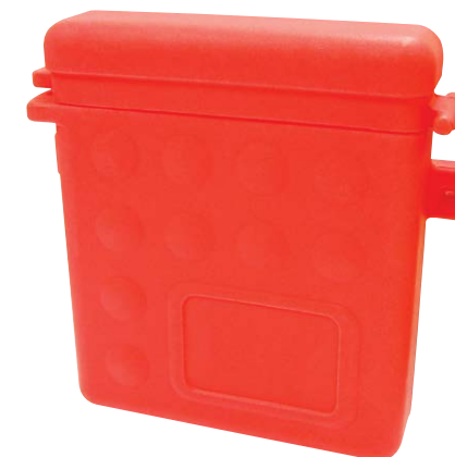
› X3288 : Red Document Holder