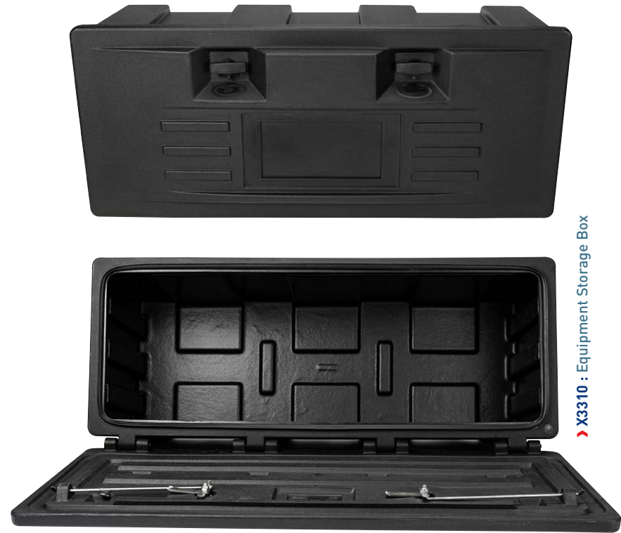
› X3310 : Equipment Storage Box