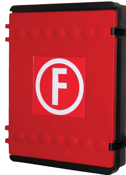
› X3289 : Layflat Hose Cabinet