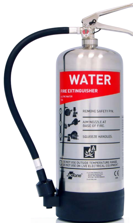
› EWS6PS : 6 Litre Water Polished Stainless Steel