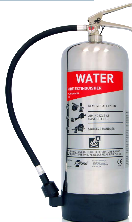
› EWS9PS : 9 Litre Water Polished Stainless Steel