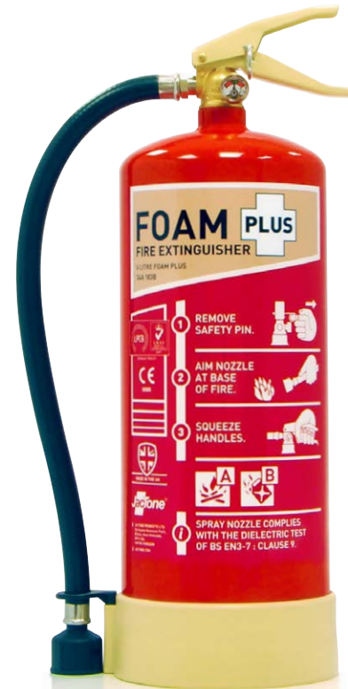
› EFS6PLUS : 6 Litre Foam Plus