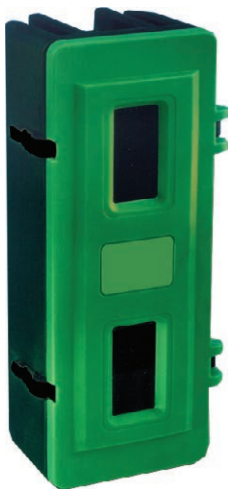
X3275GB | Equipment cabinet