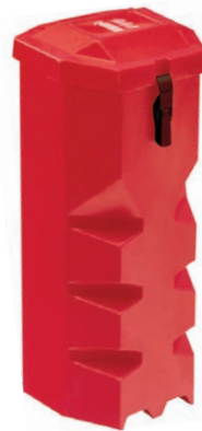
X3281 | 6kg Extinguisher Vehicle Cabinet