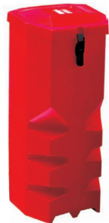
X3282 | 9-12kg Extinguisher Vehicle Cabinet