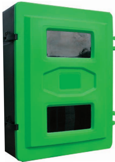
X3277GB | Equipment cabinet