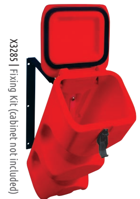
X3285 | Fixing Kit (cabinet not included)