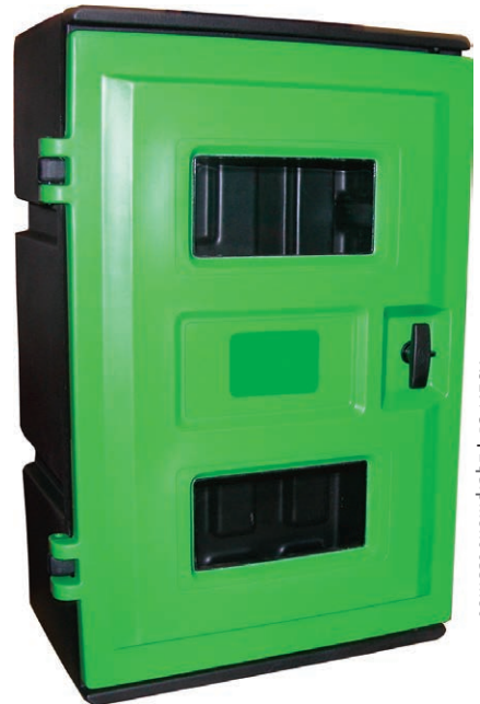
X3279GB | Equipment cabinet