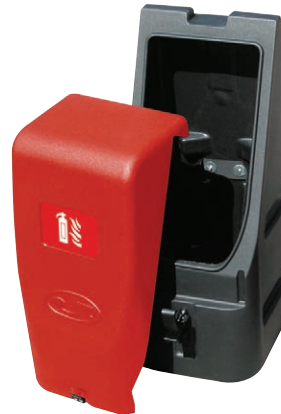
X3283 | 6kg Extinguisher Vehicle Cabinet